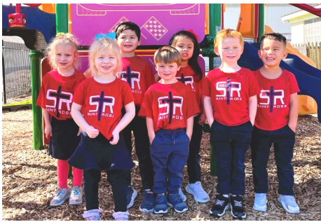
Early Childhood Education