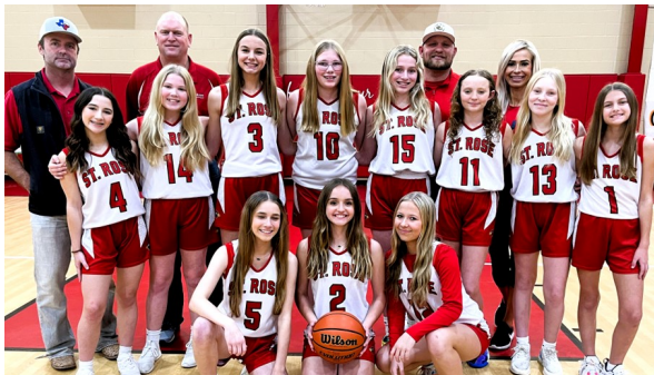
Competitive Athletic Program

Train up a child in the way he should go; and when he is old, he will not depart from it.